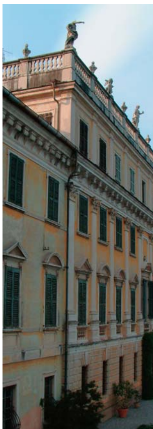
Bogliaco - Palazzo Bettoni

The façade overlooking the lake is the most sumptuous part of the villa, whilst the park behind the building includes rare and valuable trees. Between October 1943 and April 1945, Villa Feltrinelli was the residence of Benito Mussolini, who lived there with his family. Nowadays the building has become a luxurious Villa-Hotel: the "Grand Hotel a Villa Feltrinelli".