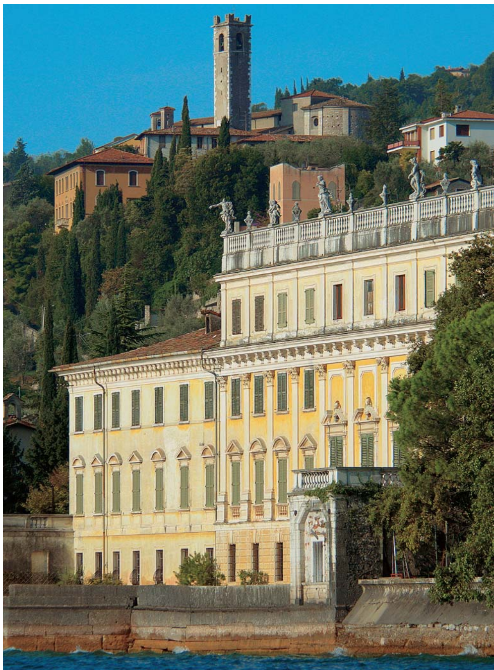
Bogliaco - Palazzo Bettoni