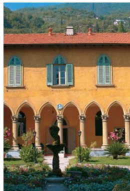
Villa - Convento di S. Tommaso