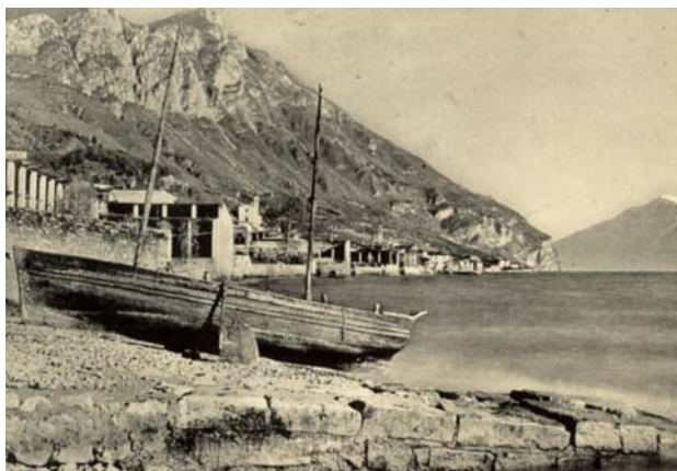
Villa - 1908