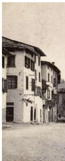
Villa - 1912

In the hamlet of Villavetro, the house of the illustrious musician and composer can still be seen today, in the street named after him. A plaque commemorating his birth identifies the house itself.