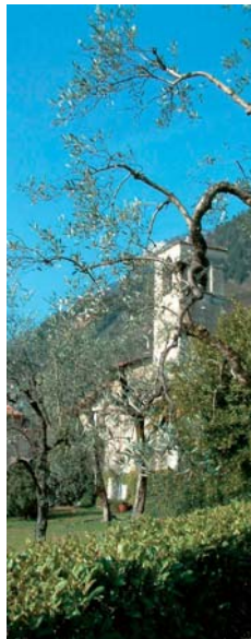
Fornico - Chiesa di S. Valentino