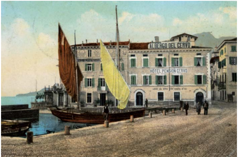
Gargnano - 1913