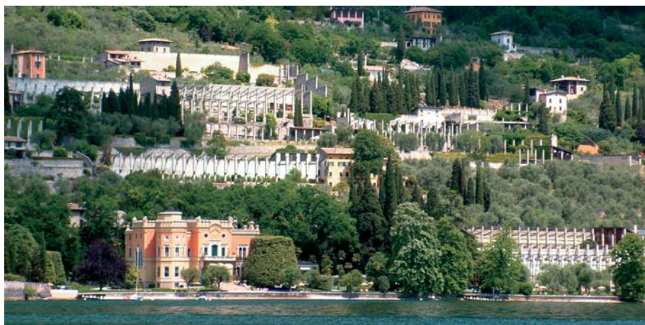
Gargnano - Villa Feltrinelli