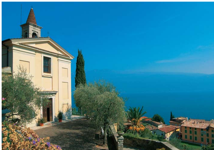
Villa - Chiesa di S. Tommaso