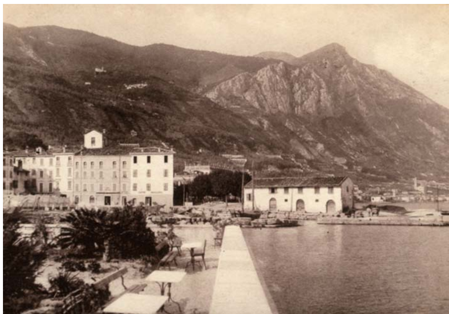
Bogliaco - 1911