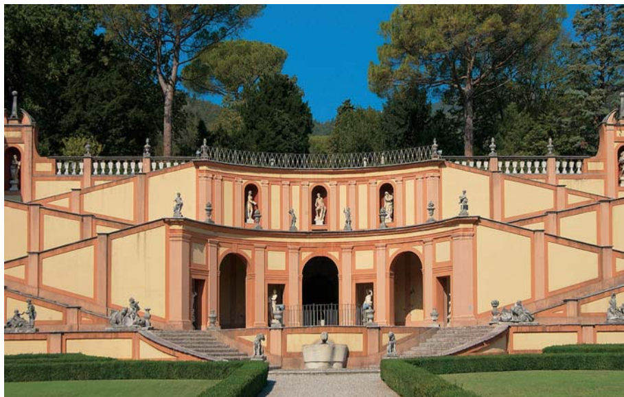
Bogliaco - Giardino di Palazzo Bettoni