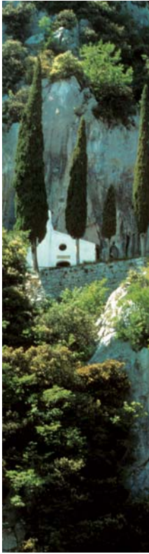
Eremo di S. Valentino