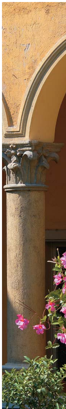
Villa - Convento di S. Tommaso